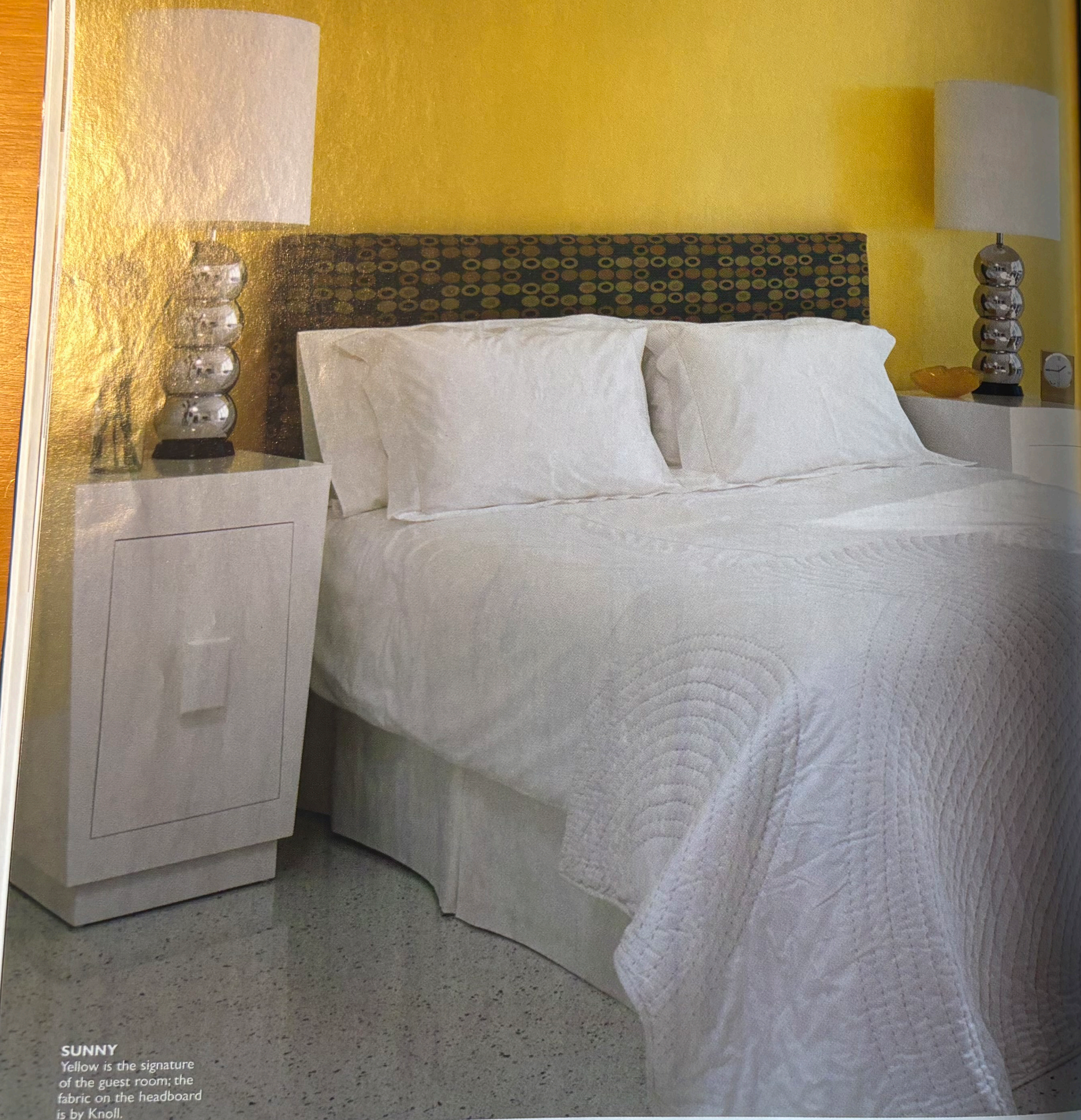
SUNNY Yellow is the signature of the guest room; the fabric on the headboard is by Knoll.

in white lacquer, just like the condo's walls. Atop this foundation of glossy white midcentury modern bones, Lamb scattered brilliant colors keyed to the flecks in the terrazzo floor. Each room is defined by a single supersaturated hue: orange in the living area (with a single contrasting accent wall in a daring, but perfectly harmonious, shade of teal), yellow in the guest bedroom, blue in the master suite. "We decided to do the three different bathrooms in three different colors, so there's a green, an orange and a blue," Lamb said. "I love color, and I love combining a lot of different colors together." The white lacquer on the walls and furniture exerts a modulating influence, rendering the colors coolly vibrant, never garish.